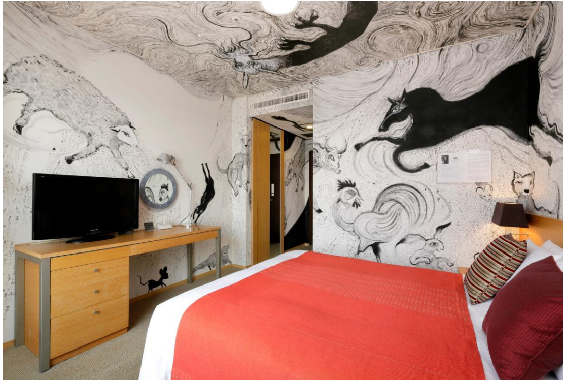
Room viewed from the window -- a dragon is drawn on the ceiling.

[Producer] creative unit moon ( http://www.mooon.jp )