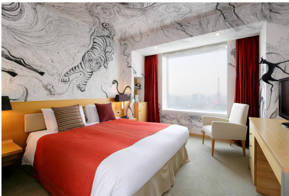
Artist Room Zodiac

The hotel is looking forward to seeing you at the Artist Room Zodiac soon.