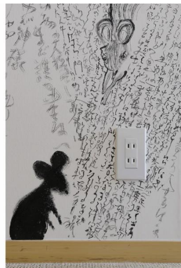
Twelve animals, starting from the rat, are drawn in the room. The tale of the 12 signs of the Zodiac is written on the wall.