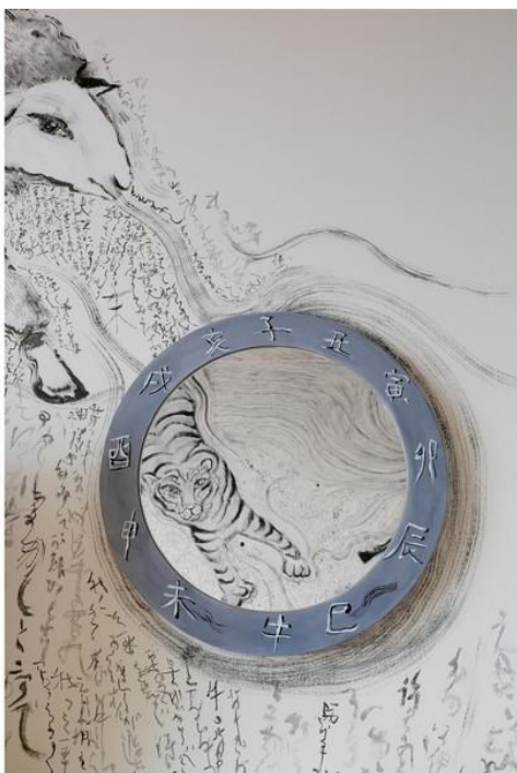
Guests can see the tiger in the mirror when lying on the bed.