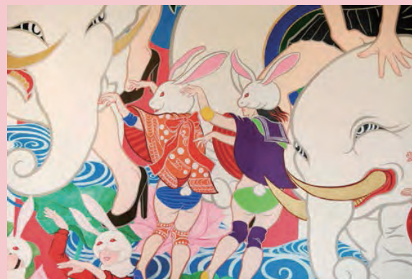
Women dancing in rabbit costume