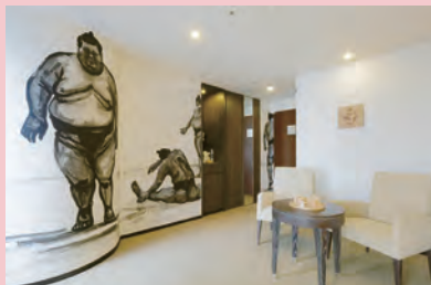
Dec. 2012 No. 1 Artist Room Sumo HIROYUKI KIMURA