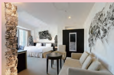
Nov. 2013 No. 3 Artist Room Washi NAOKI TAKENOUCHI