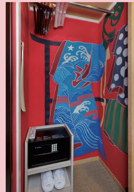
"Happi Coat" in the closet