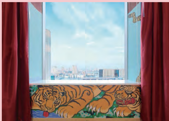
Tokyo Bay from the window

The artist painted the room with the sincere wish that those who visited it would be reborn.