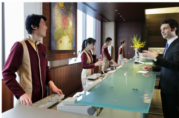
the reception desk