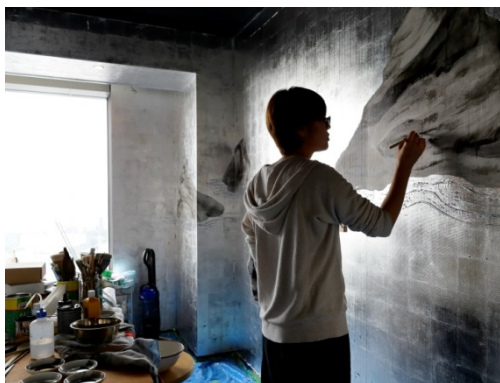
“ Wabi Sabi ” by Conami Hara

※Coverage of the Artist Rooms on creation are available on request.