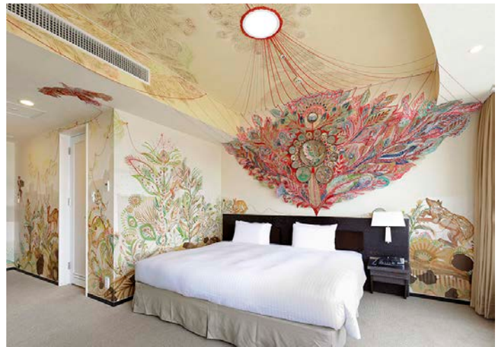
Artist Room En by Mariko Kobayashi

Park Hotel Tokyo started a project in December 2012 in which an artist decorates an entire room. With 31 different artists decorating as many rooms with themes such as "sumo" and "zen," turning the floor into the full-fledged "Artist Floor."